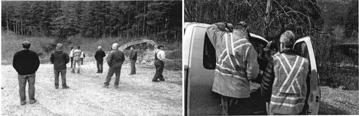
Photos from Mandatory Contractor Site Visit and Meeting with BC Hydro