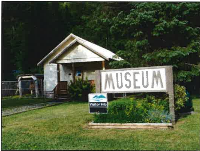
Figure 9: The Zeballos Museum

The Zeballos Museum, bursting with artifacts donated by current and past residents, is a favourite stop for many visitors. One can get a glimpse of the early days of Vancouver Island’s only gold rush, our iron mining, and logging industries. The Museum is open during the winter months on an on-call basis, and during the summer months it has a part-time host with regular hours. The Museum host was kept busy explaining to the visitors why the bridge was closed, how to get to the other side and what they could see there.