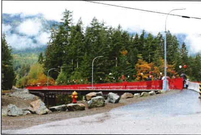
Figure 5: The new Sugarloaf Bridge on the morning of the Official Opening Celebration in October.

Taking on an inhouse Official Community Plan review on top of coordinating all the moving parts of the bridge project kept all staff hopping.