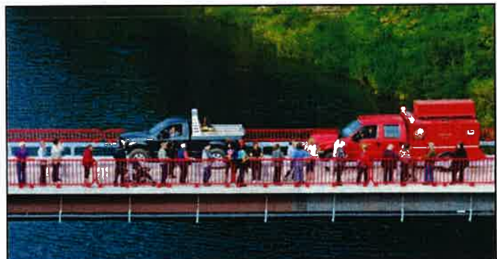
Figure 4: Parade of vehicles over the new Sugarloaf Bridge in September.

Over that three and a half month period the old bridge was removed and the new one constructed. Residents celebrated with a 'soft opening' in September before Council attended the