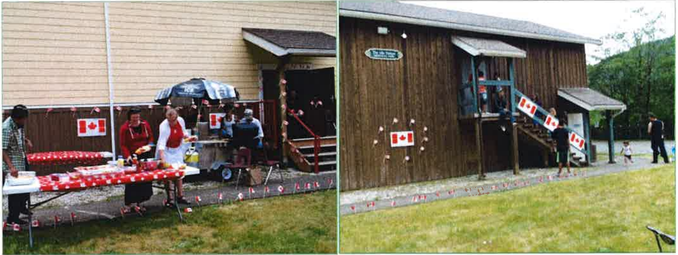
Figure 7: Canada Day celebration at the Community Hall.

The Community Hall was also used for information gathering and open houses for both the Official Community Plan and the Sugarloaf Bridge.