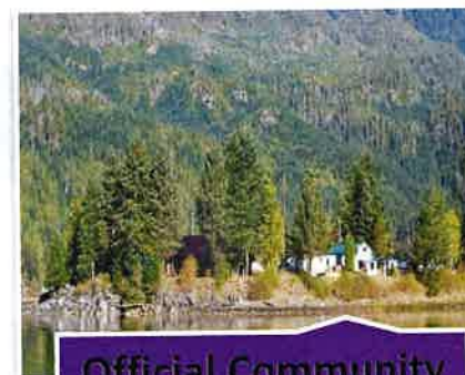
Official Community Plan