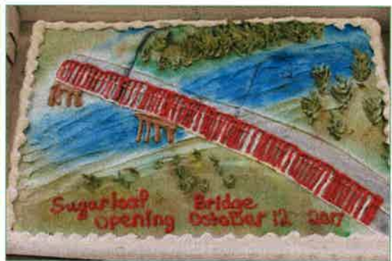
Figure 6: Lunch, and of course, CAKE after the Official Ribbon Cutting ceremony in October.