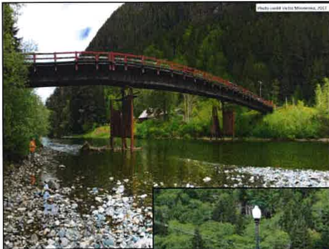
Figure 12: Sugarloaf Bridge - Before

Meanwhile, the grass continued to grow and our staff continued to cut. As we didn't get lost in a sea of green, it appears our staff won the war.