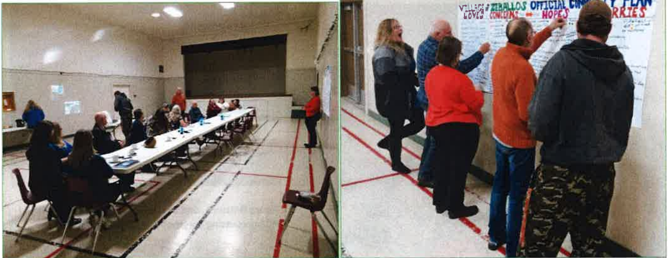
Figure 8: Official Community Plan consultation with residents April 2017.

The Community Hall was also used for information gathering and open houses for both the Official Community Plan and the Sugarloaf Bridge.