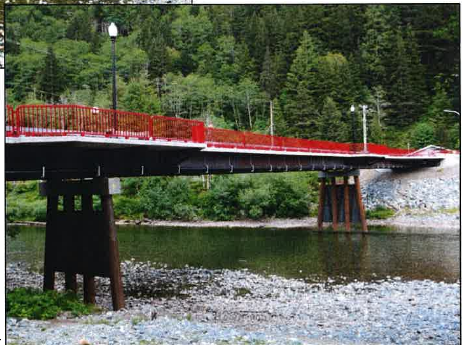
Figure 11: Sugarloaf Bridge - After