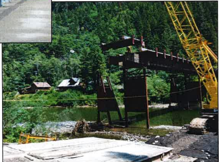
Figure 3: Demolition of the old Sugarloaf Bridge.

Lobbying for change is a slow process. The condition of the driving surface of the FSR Zeballos and FSR Fair Harbour has always been a challenge. The lack of consistent maintenance funding was a focus of Council in 2017.